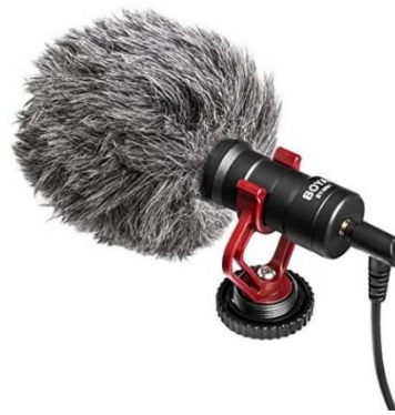
Directional mic with fur windshield