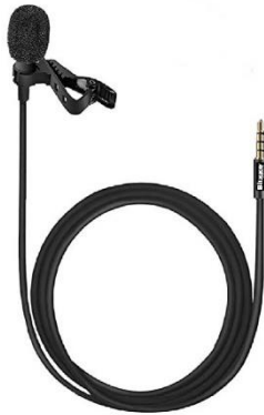
Personal clip-on mic Foam windshields are effective in gentle breezes Furry ones are best

Small external (not very expensive) microphones are available to replace the built-in microphone. Either clip-on / lavalier / personal (the name used varies) mics or little directional mics (consider these if you need to cover, say, singer and guitar) and both types come (generally) with windshields -