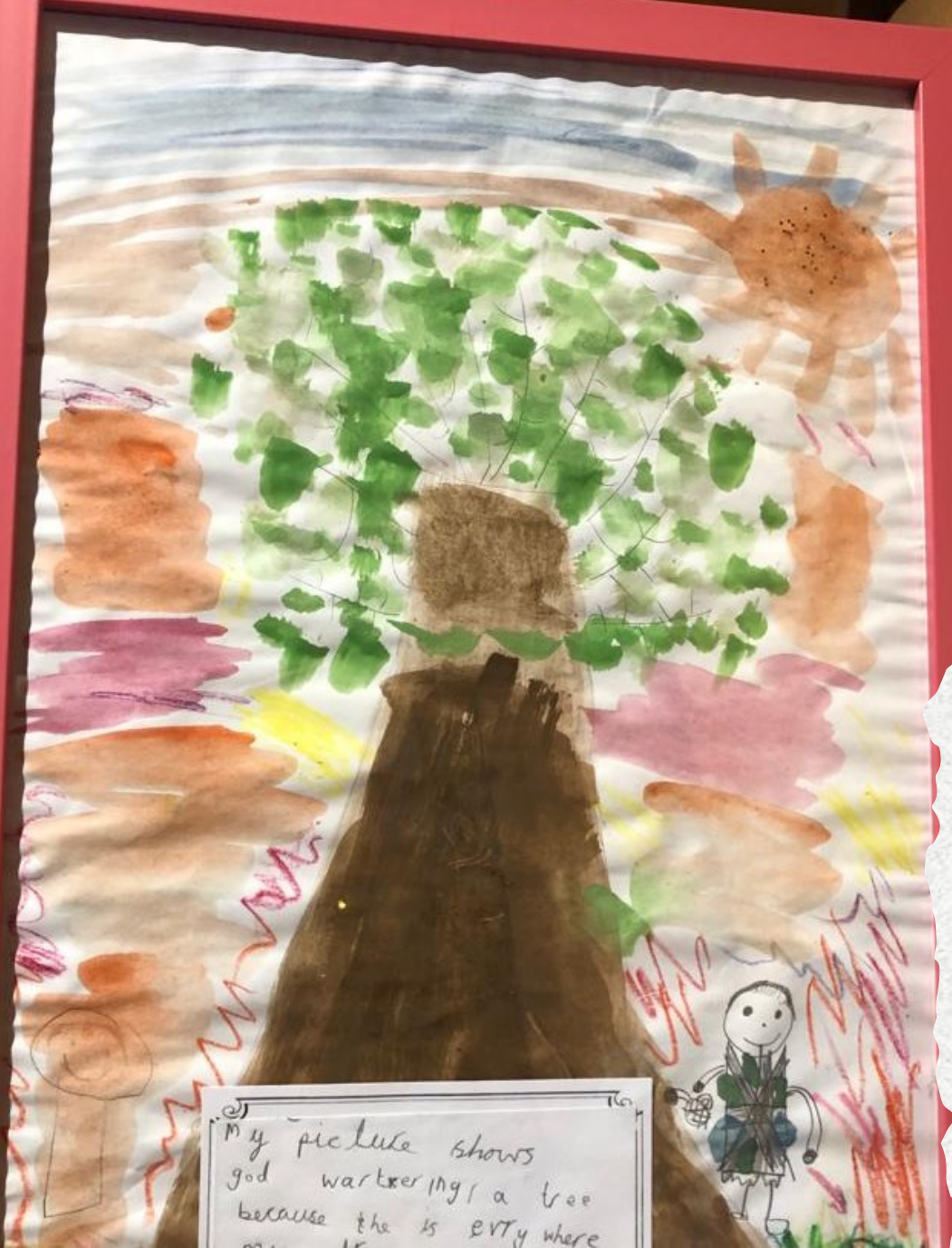
My picture shows god watering a tree because he is evry where