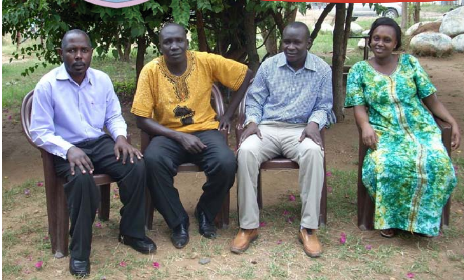
The new leadership team at JDMSS