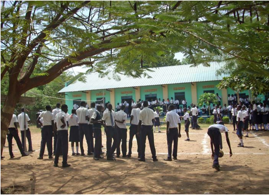
The excitement and support of the whole school is demonstrated in this picture!